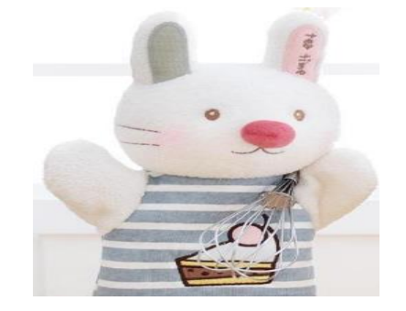
Example of category III