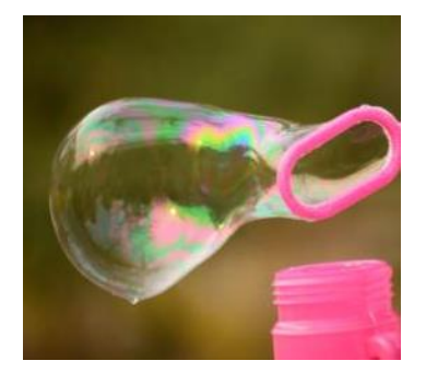
Example of category II